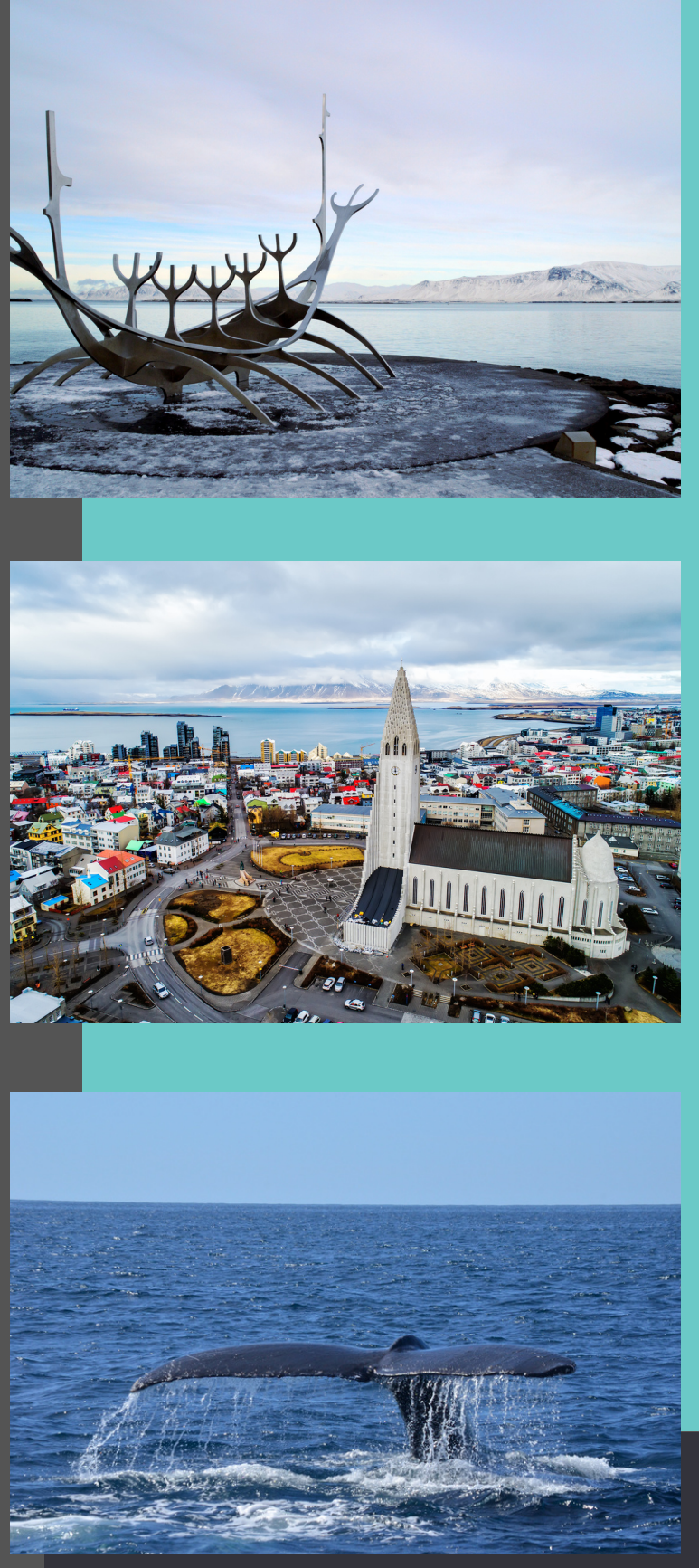
Optional Tour: Whale Watching Adventure: € 135